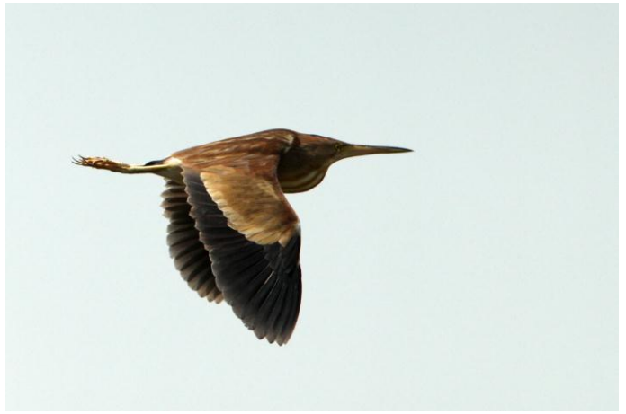
Left: Chinese Egret at Nanpu ( Ginny Chan ) Right: Yellow Bittern at 'Tree Lane' ( Adrian Boyle )

Again, other birding was limited. The passerine migration is all but over with just a few birds seen along the wall and at other sites. A trip to 'tree lane' on the 30 th produced few passerines except for large numbers of singing Oriental and Black-browed Reed Warblers. We did, however, see a surprising number of small Bitterns with over 50 Yellow and 1 Schrenck's. Although some were seen displaying and pairs seen chasing each other, a subsequent visit produced much smaller numbers so perhaps many were migrants. It now seems that this marsh land, reed bed and migrant hotspot is set to be turned into a housing estate and (another) golf course so maybe we won't be visiting this site next year ... sad times.