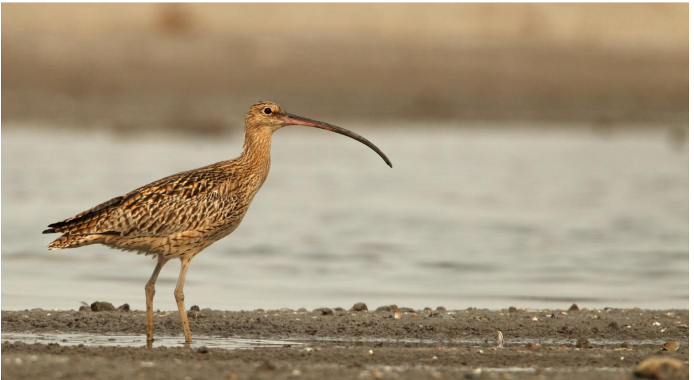
Eastern Curlew ( Adrian Boyle )