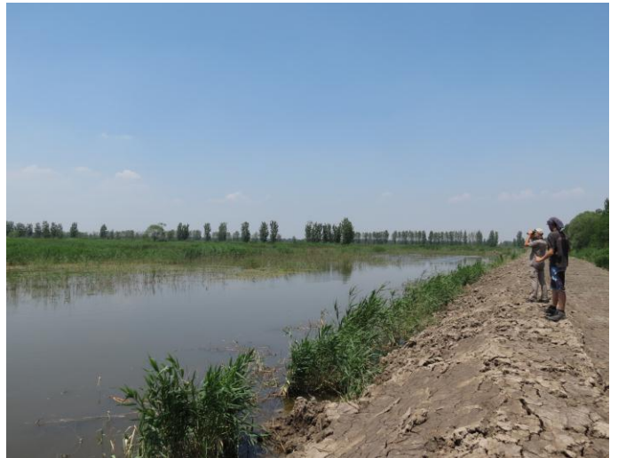
Left: 'Spoony corner' This great little birds' favourite corner... well, the place we saw it the most. It wouldn't be so bad without the trucks thundering past every few seconds. Right: Work has begun at 'Tree lane' already