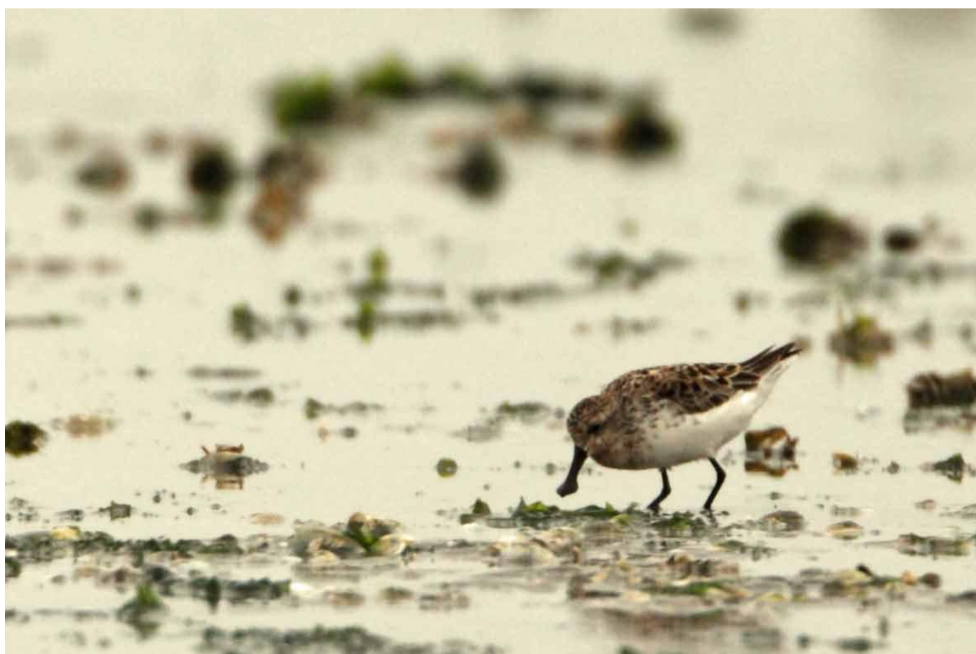
Spoon-billed Sandpiper – for more information on the recovery project see www.sbsproject.wordpress.com