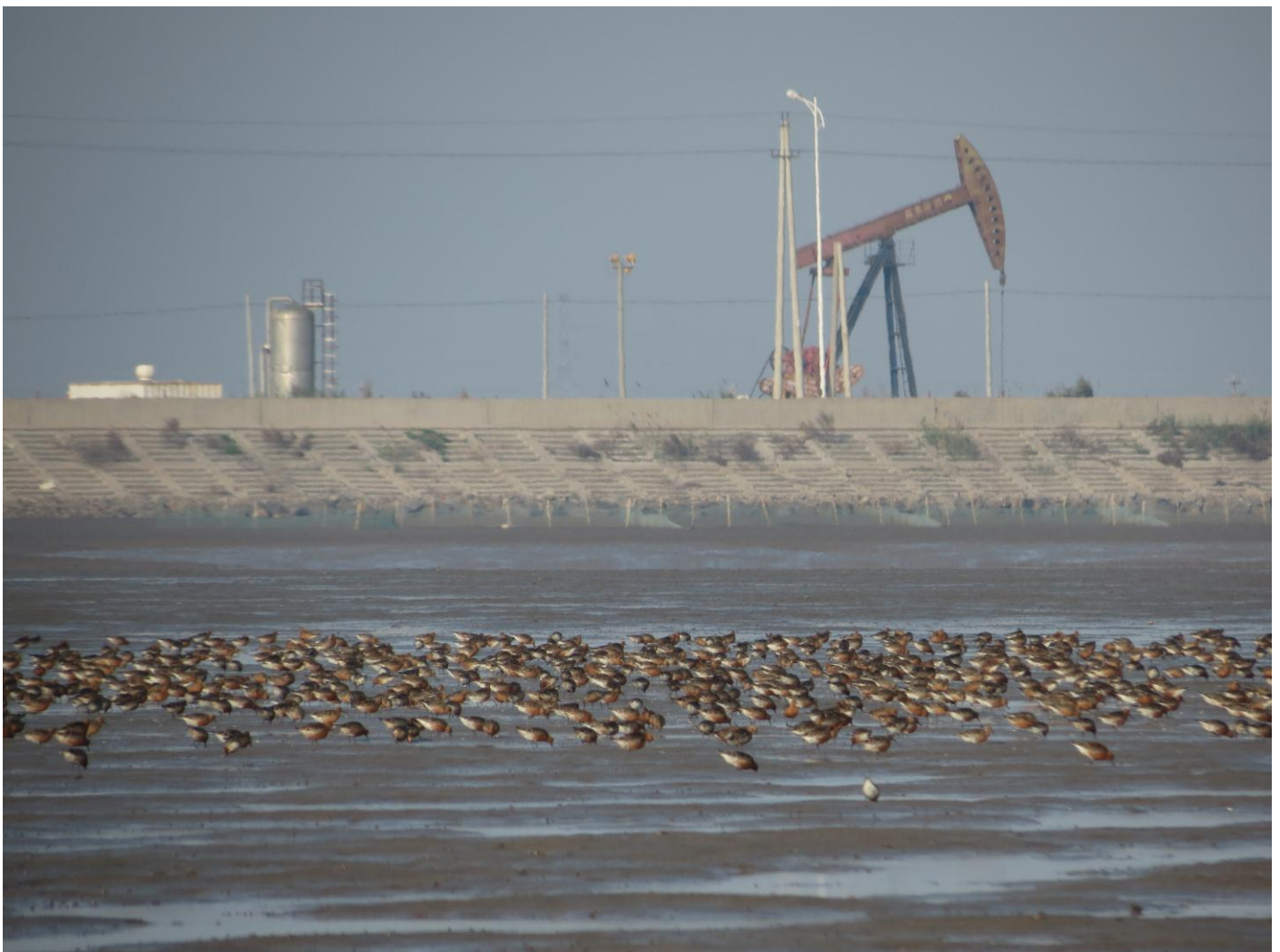
Feeding Red Knot flock. Beautiful birds with an unfortunate backdrop of an oil well (Ginny Chan)

Weather in the last few days of May was perfect for evening scanning with the sun, low to the south-west, perfectly illuminating the Knots making for spectacular views out on the mud. With these excellent conditions we did very well for colour bands. We had many successful sessions although one in particular, with the additional eyes of Professor Piersma, was exceptional. In a few hours we saw 74 individually identified colour banded birds from north-west Australia (approx. 10% of the total marked in this way) along with a host of other flags from elsewhere. For a site over 6000km away from the banding location this is amazing and helps to highlight how vitally important the Nanpu mudflats are.