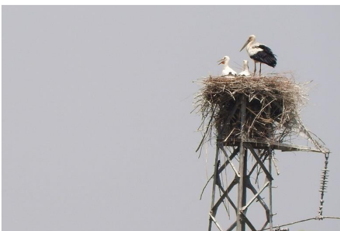
Nesting Oriental Storks with signs saying 'do not disturb'.