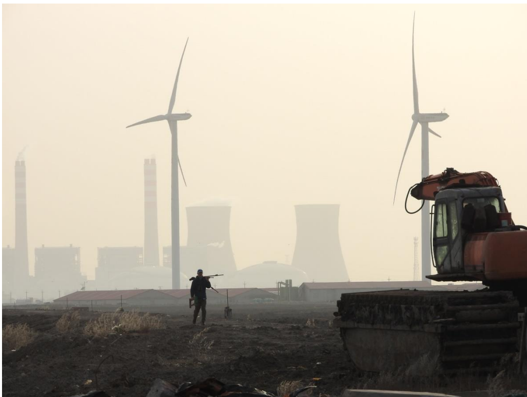
A not-so-scenic scanning site