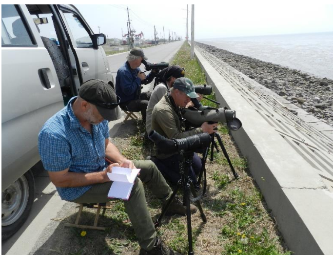
Someone has to be diligent and write things down.