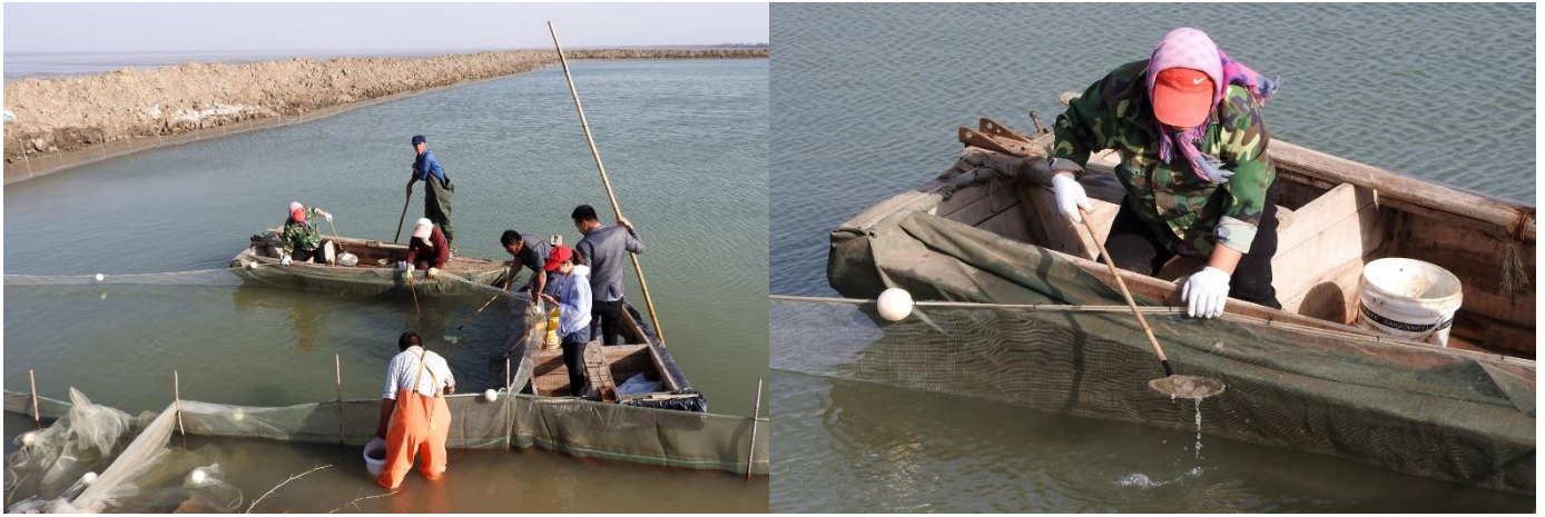
Jellyfisher people, an aquaculture practice we have not seen in previous years.